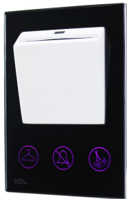
Figure 2. HDL-MPTC03.46