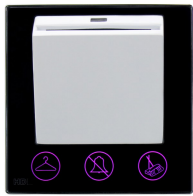
Figure 1. HDL-MPTC03.48